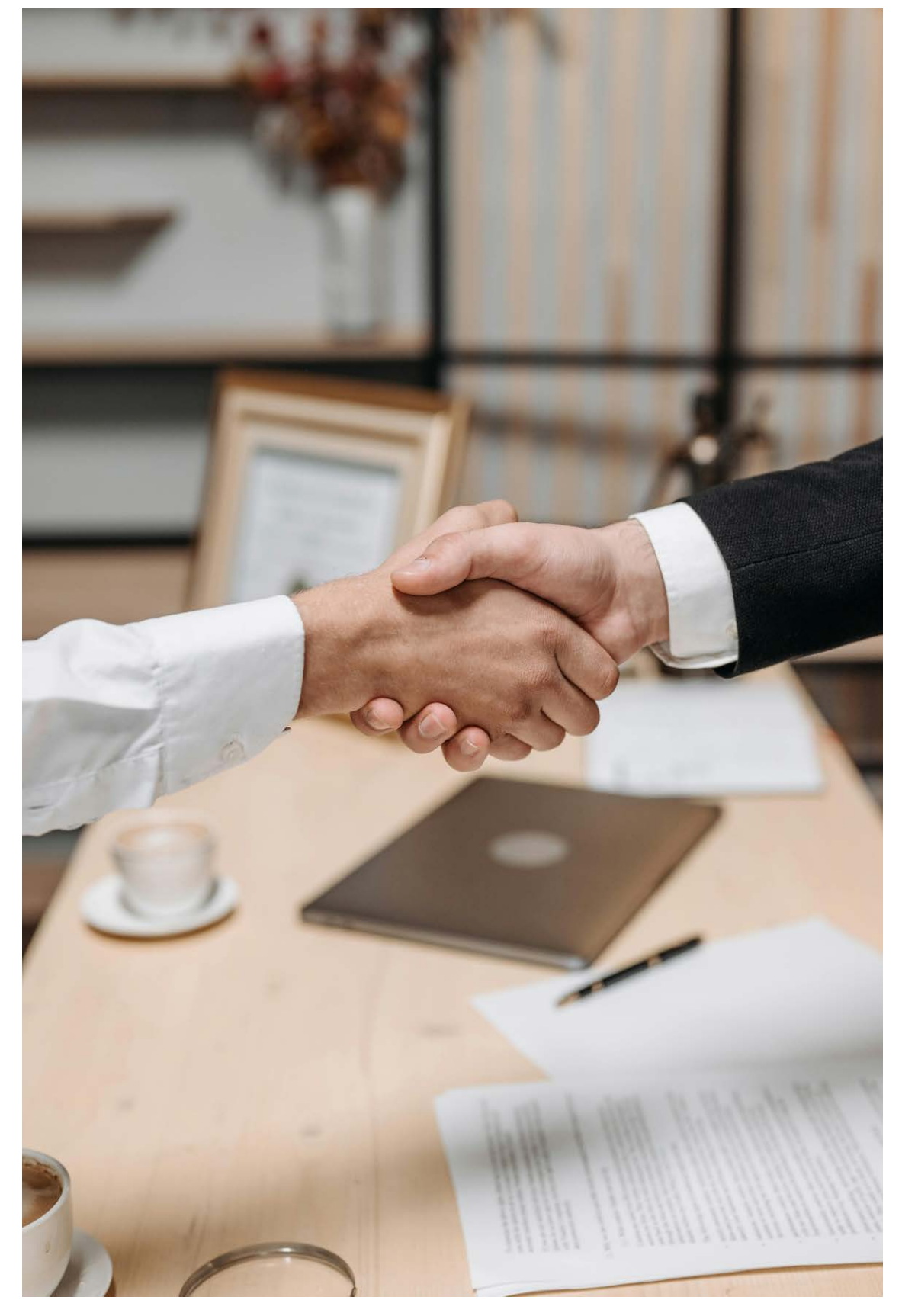
TAX COMPLIANCE FOR ENTERPRISES HAVING RELATED-PARTY TRANSACTIONS

On 10 February 2025, the Government issued Decree No. 20/2025/ND-CP ("Decree 20") amending Decree No. 132/2020/ND-CP dated 05 November 2020 guiding tax compliance for enterprises having related-party transactions. Decree 20 takes effect from 27 March 2025 and applies the tax year 2024.